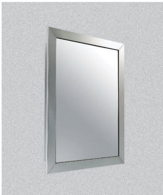
Stainless Steel Cabinet with Frame