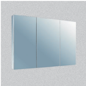
Stainless Steel Tri-View