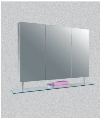
Stainless Steel Tri-View with Shelf