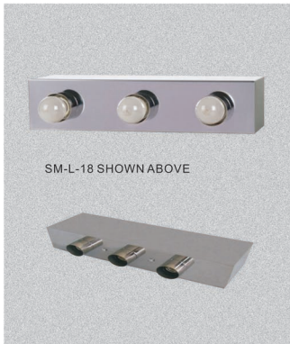
SM-L-18 SHOWN ABOVE