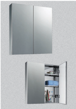
Stainless Steel Dual Door