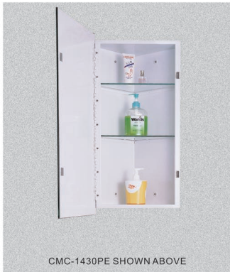
CMC-1430PE SHOWN ABOVE