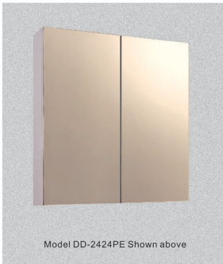
Model DD-2424PE Shown above