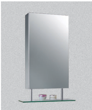
Stainless Steel Single Door with Shelf