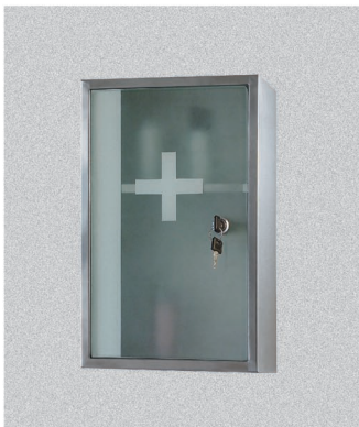
Stainless Steel Cabinet with Lock