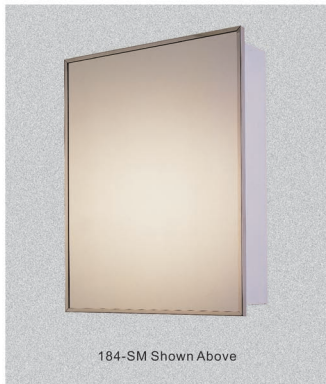
184-SM Shown Above