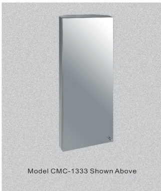
Model CMC-1333 Shown Above