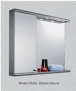
Model 3528L Shown Above