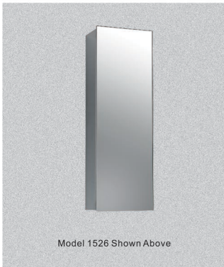
Model 1526 Shown Above