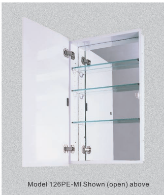
Model 126PE-MI Shown (open) above