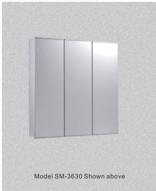
Model SM-3630 Shown above