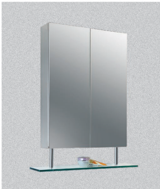
Stainless Steel Dual Door with Shelf