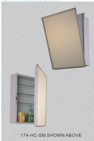
174-HC-SM SHOWN ABOVE