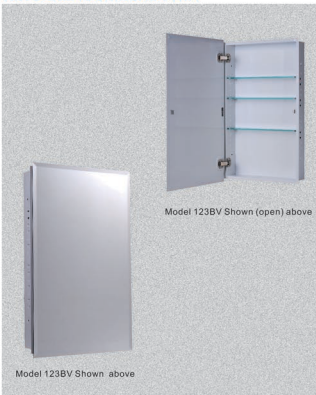
Model 123BV Shown (open) above