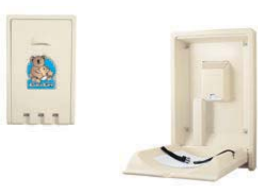
#KB101-00 VERTICAL, WALL-MOUNTED Cream-color polyethylene cabinet and bed. Unit 22" W x 35 ½" H (560 x 900mm). Depth (closed) 5 ¼" (135mm). Extension (open) 35" (890mm). Available from Bobrick in cream-color only.

KB110-SSWM HORIZONTAL, WALL-MOUNTED 18 gauge, type 304 satin stainless steel exterior finish with molded grey color polyethylene interior. Unit 35 <sup>1</sup>/<sub>4</sub>" W, 20" H (890 x 510mm). Depth (closed) 4" (100mm). Extension (open) 15 <sup>3</sup>/<sub>16</sub>" (385mm).