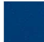
Deep Blue (S203)