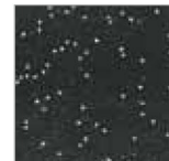
Starry Night (S225)