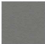
Charcoal Gray (M248)