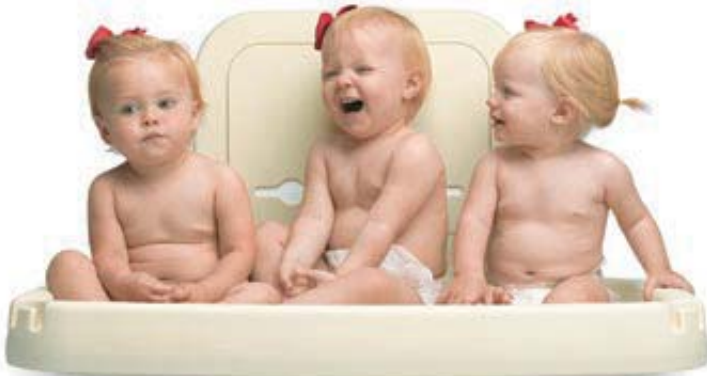
Please, one baby at a time. The three babies shown are to dramatize the strength of the KB200.

Customers have the option of ordering Koala products and colors listed on page 38 from Bobrick or Koala. Products on page 39 are ordered through Koala only.